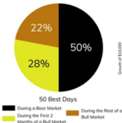
S&P 500 Index Best Days: 1995 - 2024

*Source: Ned Davis Research, Morningstar, and Hartford Funds, LLC